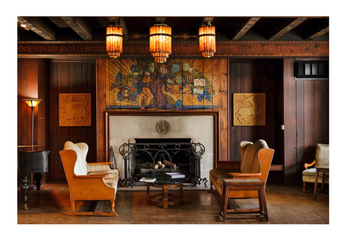
Historic Scarab Club Farnsworth Street, Downtown Detroit Street view and Interior view (detail, lounge). Original home and meeting space of the Book Club of Detroit for many years.