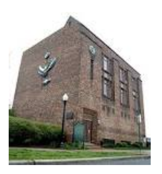
Gallery Book Club of Detroit (1958 - )