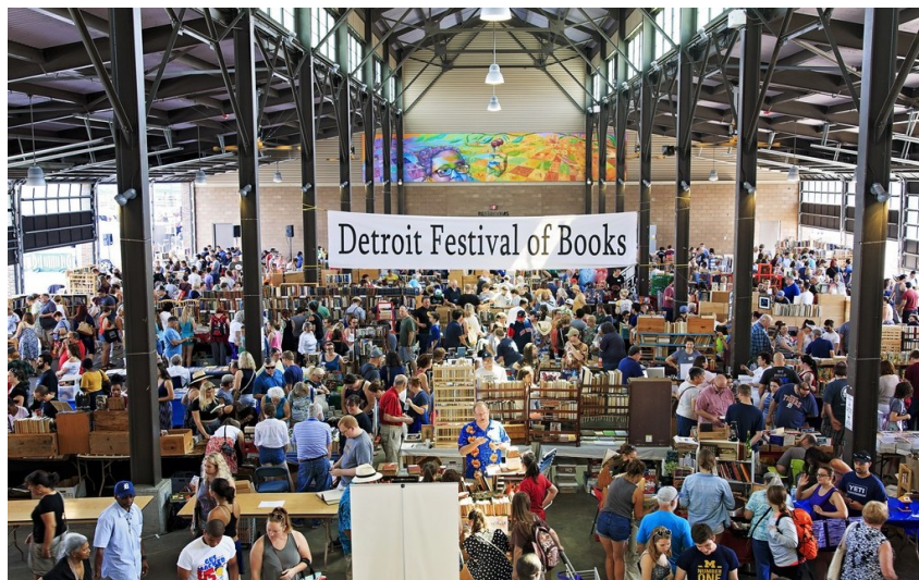
Floor View, 2018, Setting An Attendance Record