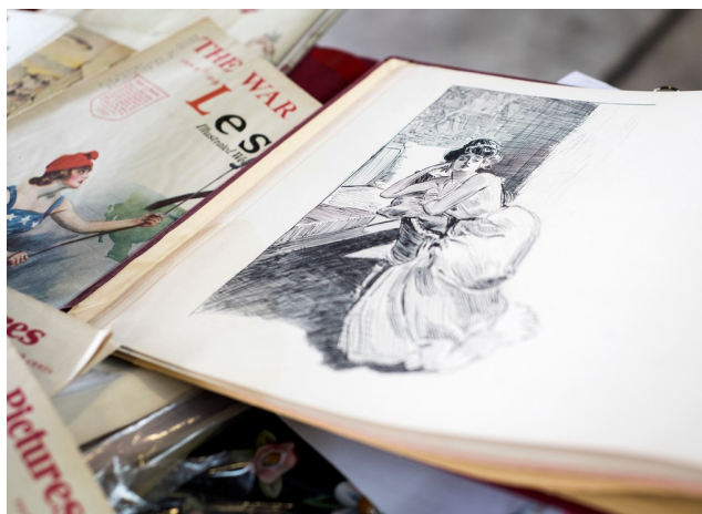
"Ah, such a grand lady," saith the customer. "I am smitten, love her style. But, WHAT? Did I hear you right? You want how much for this dusty ol' book?"