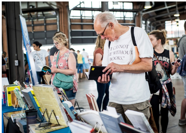
People Of The Book Readily Announce Themselves (T-Shirt Slogan, above: I Cannot Live Without Books )